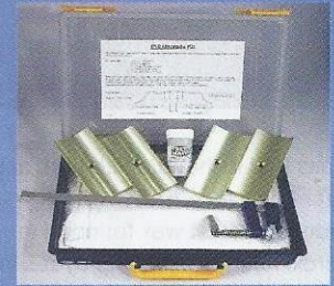
2.5" & 3" 690E Upgrade

Active Capillary. A state-of-the-art innovation designed developed and patented by Freeze Master for electric pipe freezing machines. The electronic valve system takes the place of a simple basic capillary and works by delivering pre-programmed quantities of refrigerant to the freeze heads.