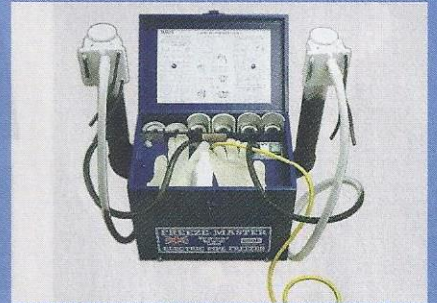
690E Heavy Industrial 8mm-61mm