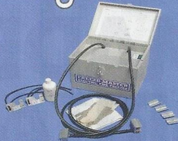
420D Industrial 8mm-42mm