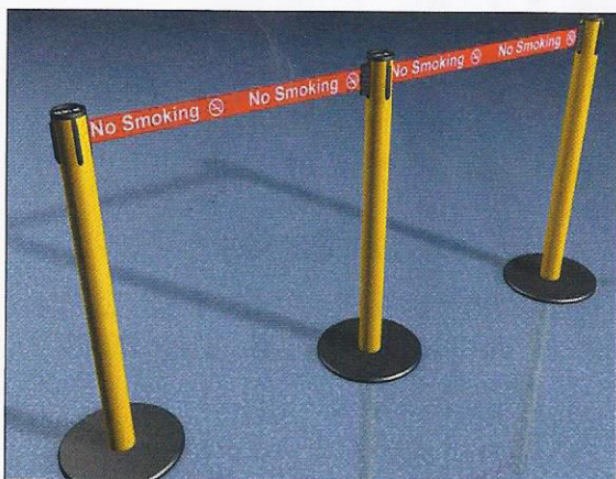
Can be used to warn of hazards or issue directions

QM Group , designer of queue management systems, has introduced a new product for the health and safety sector.