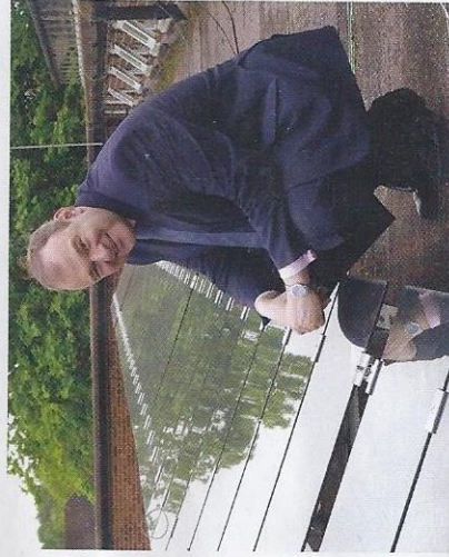
Energy Secretary Ed Davey has high hopes for the Green Deal Newcastle, Nottingham and Sheffield will have access to a £12m fund to support their own carbon reduction plans as they test the key elements of the Green Deal. Energy Secretary Edward Davey says: "These cities have ambitious plans to lower their emissions, reduce energy use and help people save money on their bills. I've been really impressed by

High expectations have accompanied the launch, with Government claiming that the Green Deal will stimulate the low carbon economy by supporting up to 60,000 jobs in the insulation sector alone. With as many as 45 energy efficiency measures included in the scheme, the Green Deal is expected to deliver £1.2 billion worth of energy efficiency